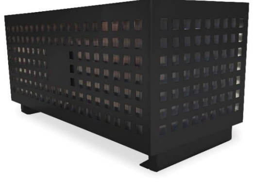
EM450 with powder coat option