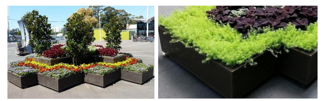
Custom Planters (City of Sydney) with perforated mild steel, zinc plated and powder coated options