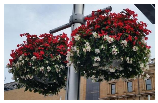
Custom Flower Baskets (City of Sydney), galvanised steel