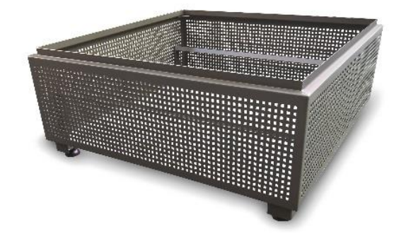
Custom Planters (City of Sydney) with perforated galvanised steel, zinc plated and powder coated options